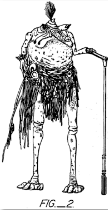
Fig. 2 of US D277213