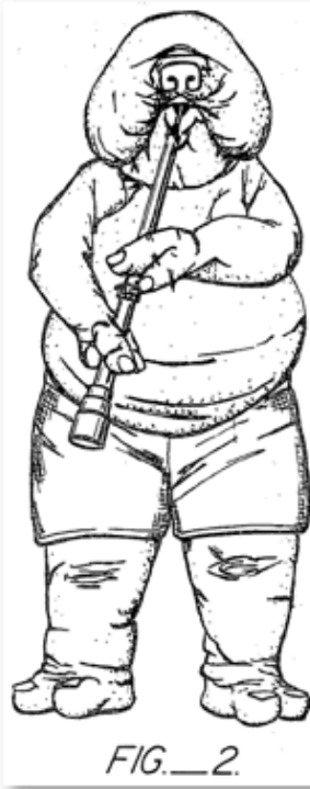
Fig. 2 of US D277,303