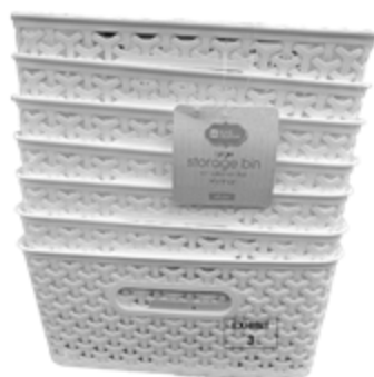
Curver: Accused Basket

The Board disagreed. It limited Curver to its “atypical situation,” and thus deemed the “lip implant” references irrelevant. See J.A. at 7. The Board also cited utility patent precedent that “the question whether a reference is analogous art is irrelevant to whether that reference anticipates.” Id. (citing In re Schreiber , 128 F.3d 1473, 1478 (Fed. Cir. 1997)). SurgiSil appealed.