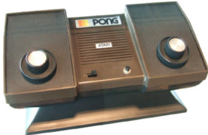
Pong, the subject of Magnavox v. Activision – The Progenitor of Video Game Cases

Several of Activision's games throughout the 1980s had a "ball and paddle" format similar to that described by Magnavox's patent. When Magnavox claimed infringement against Activision the litigation, it was highly technical. The litigation focused on technical aspects of the Magnavox Odyssey and Activision's games, including a contention by Activision that the claim elements were recited in so-called means-plus-function format (which requires that a claim be interpreted based on the physical hardware (means) described in the patent to perform the claimed functions). Activision wanted to limit the interpretation of the patent claims to only the technology that was available at the time. If they prevailed in doing so, they could have potentially escaped infringement because the technology they used was physically different. The court, however, rejected this argument.